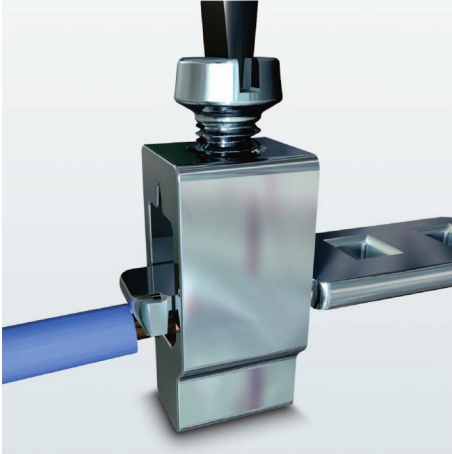
Figure 1 Screw connection