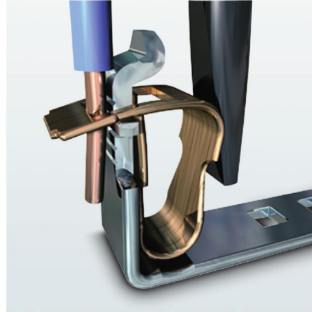
Figure 2 Spring-cage connection