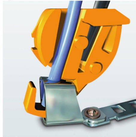
Figure 4 Fast connection