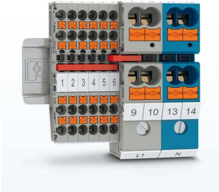
Figure 7 Distributor terminal blocks (example)

If you use distributor terminal blocks for power distribution, observe the conditions for reducing the conductor cross sections within a circuit.