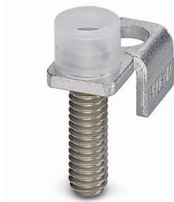
Figure 10 Chain bridges